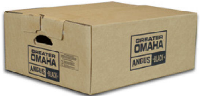
Custom Small Box Options Available